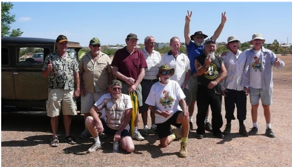
Cookie's Water Transport Eleven – White Cliffs

Well Done the Cookies! A top weekend all round.